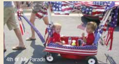
4th of July Parade

What a great year to live in Bedford! Residents came out in style for the Annual 4th of July Parade, boogied to the beat at the Concert on the Green, and climbed to new heights at the Fall Festival.