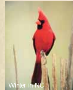
Winter in NC

The weather outside might be frightful, but inside the Bedford Clubhouse, it's just delightful. A new year has ushered in a new calendar of events for Bedford residents to take part in and assures that no one will be left out in the cold.